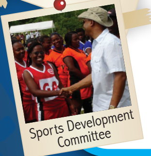
Sports Development Committee