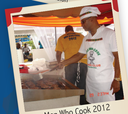
Men Who Cook 2012