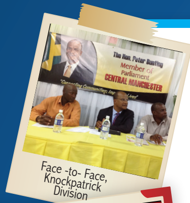
Face-to-Face, Knockpatrick Division